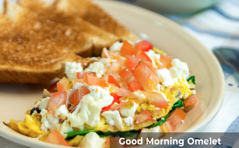
Good Morning Omelet