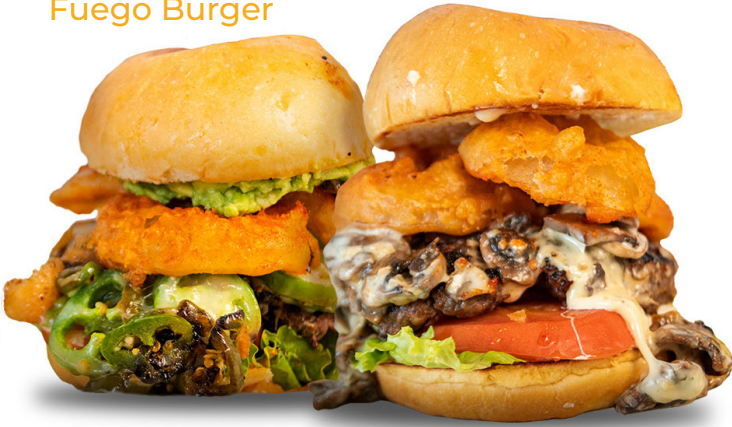
Fuego Burger Munch-room Burger

Firey seasoned beef patty, melted pepper jack cheese, creamy guacamole, crisp lettuce, fresh tomatoes, and crunchy homemade onion rings. Topped off with sautéed jalapeños and our signature spicy fuego sauce for that extra kick! 16.50.